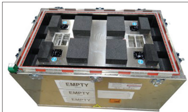
Americase's new product will be used to resupply the Nitrogen Oxygen Recharge System for the International Space Station.